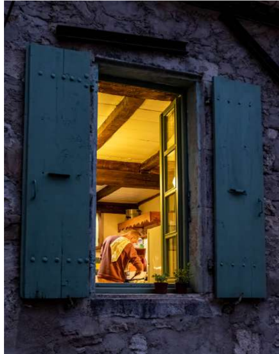
First Place - French Man Cooking Dick Light