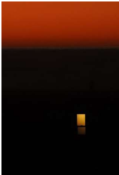
Second Place - Sunset Bathroom Break Brooks Leffler