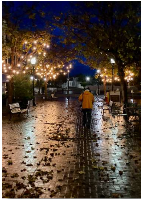
First Place - The Stroll Sandie McCafferty