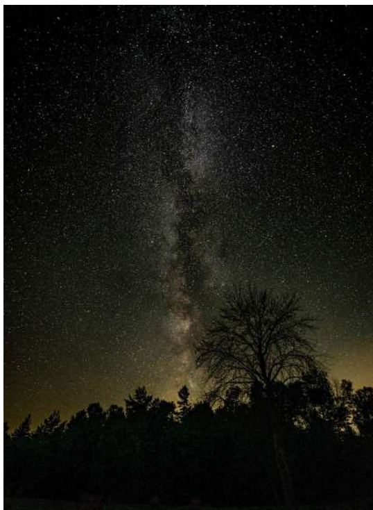
Milky Way, Newport State Park, Wisconsin