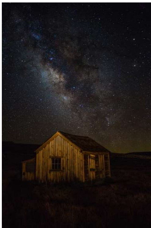
Milky Way Over Bodie