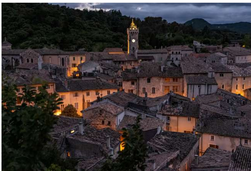
Viviers At Dusk Dick Light