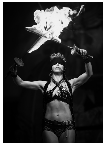
Third Place - Night Warrior