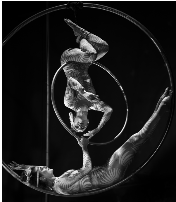
First Place - The Two Body Problem