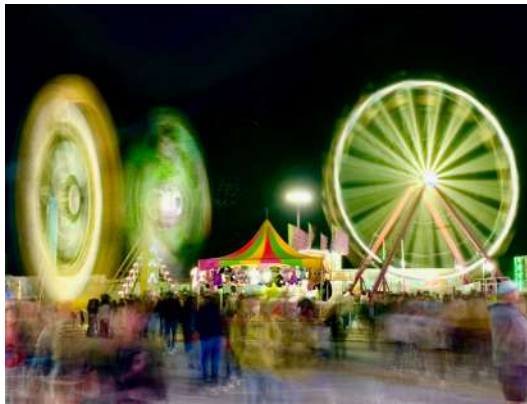
Second Place - All's Fair! Sandie McCafferty