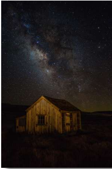
07 - Milky Way Over Bodie, CA