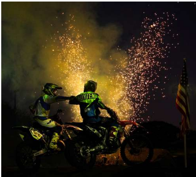
Second Place - We Can Do This